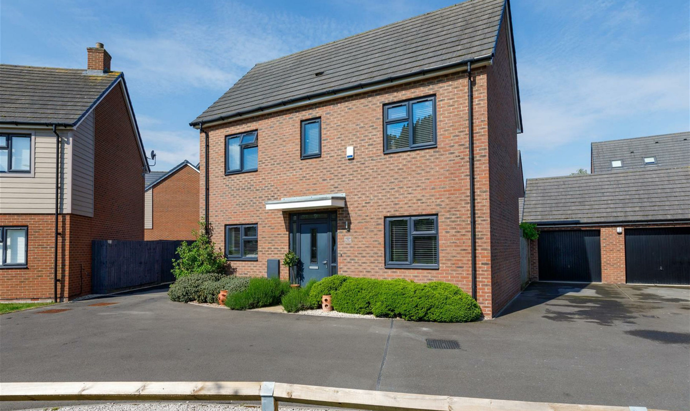
Duncan Road , Meon Vale Stratford-upon-Avon, CV37 8YP